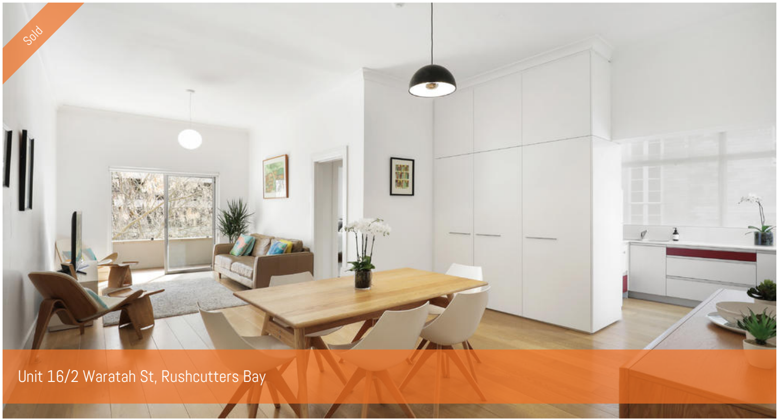
Unit 16/2 Waratah St, Rushcutters Bay