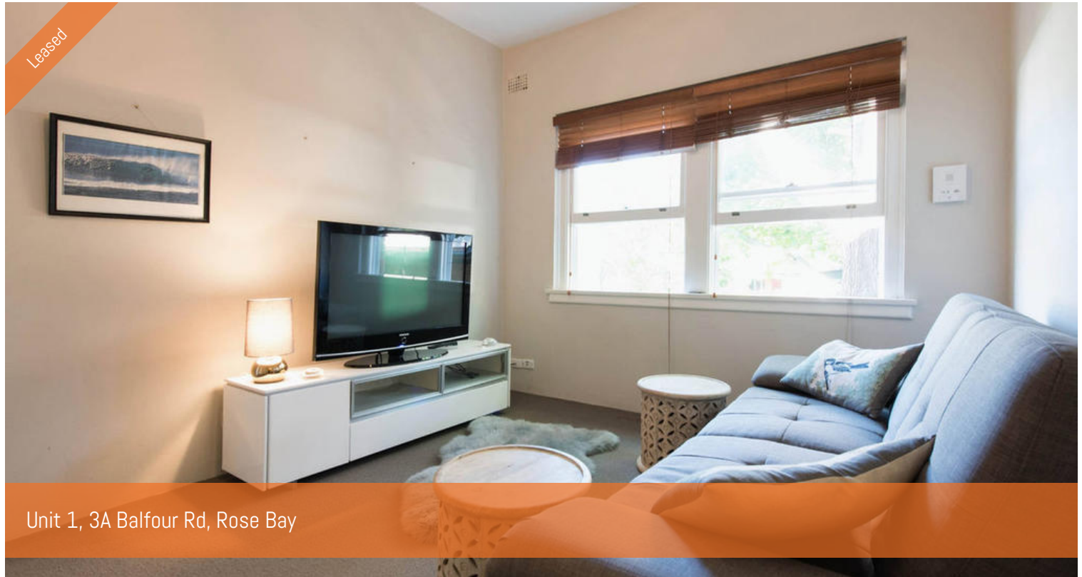
Unit 1, 3A Balfour Rd, Rose Bay